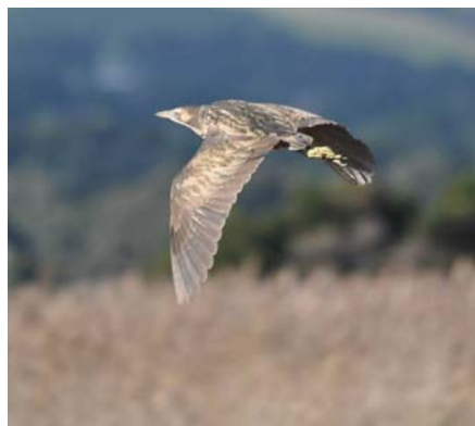
An endangered Australasian Bittern at the Tootgarook Wetland.

To ensure that the management objectives are met, all the environmental, economic, social and cultural values and threats associated with the Wetland will be identified and assessed.