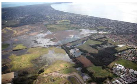
Aerial view of Tootgarook Wetland during flood.